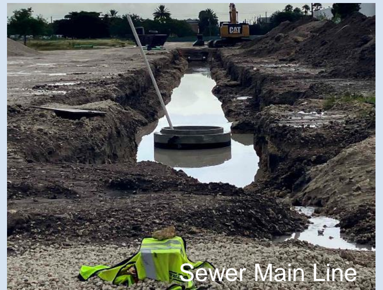
Sewer Main Line