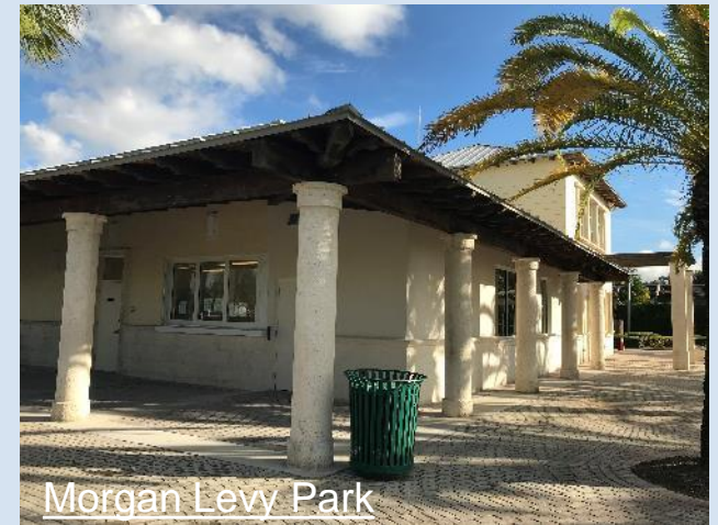
Morgan Levy Park