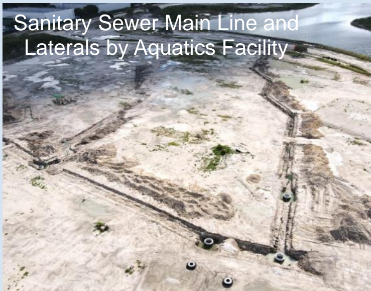
Sanitary Sewer Main Line and Laterals by Aquatics Facility