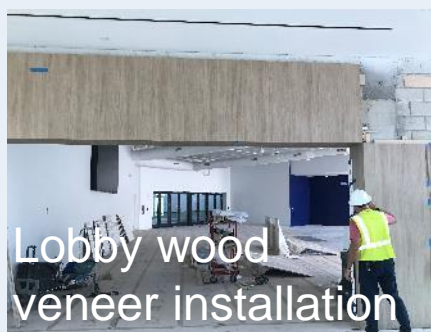
Lobby wood veneer installation