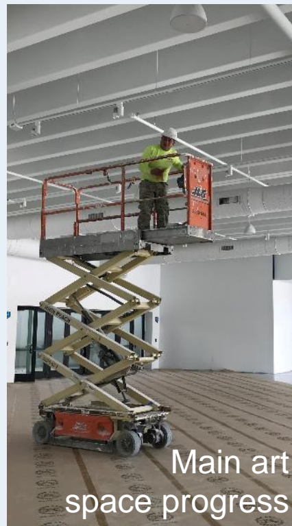
Main art space progress