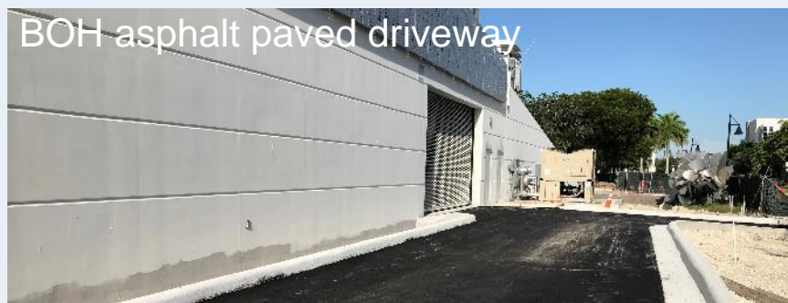
BOH asphalt paved driveway