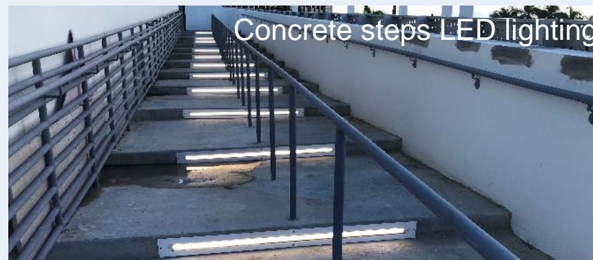
Concrete steps LED lighting