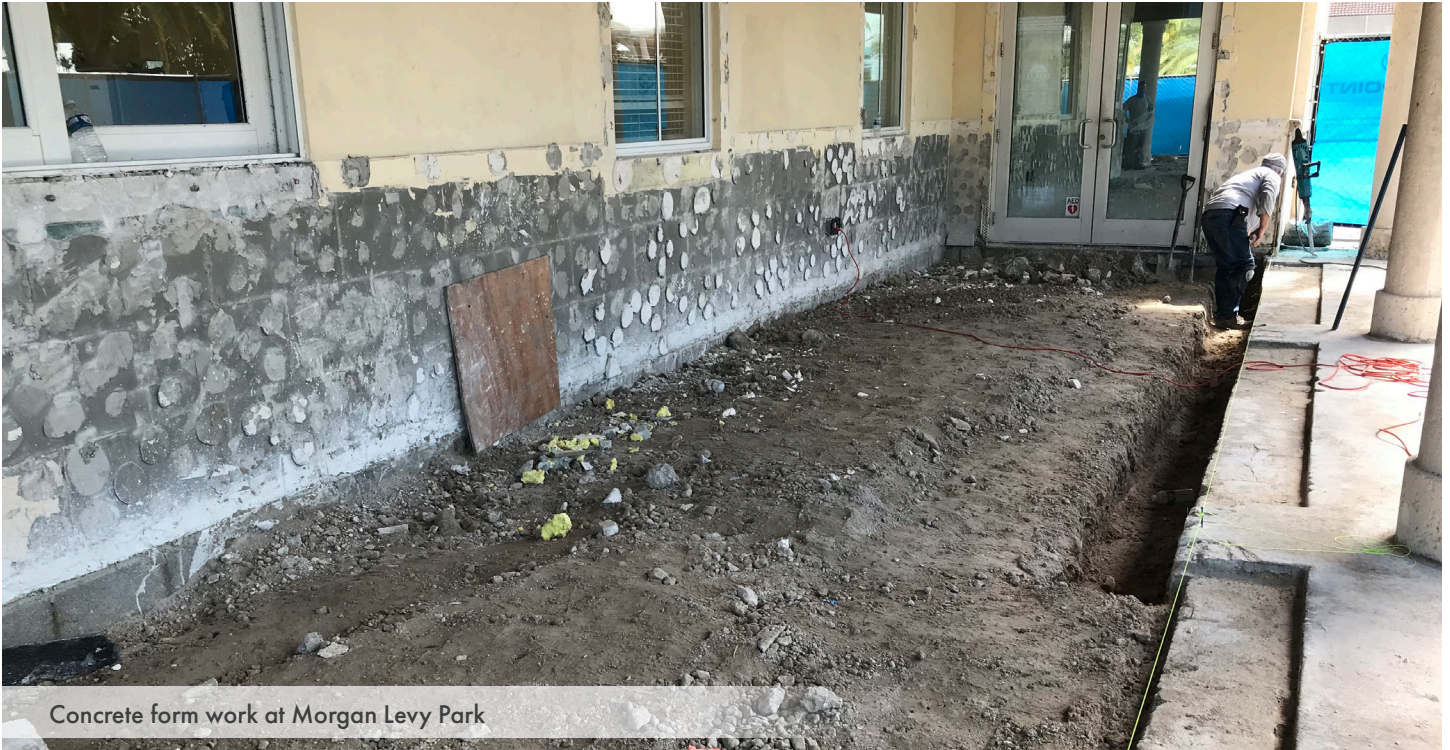
Concrete form work at Morgan Levy Park