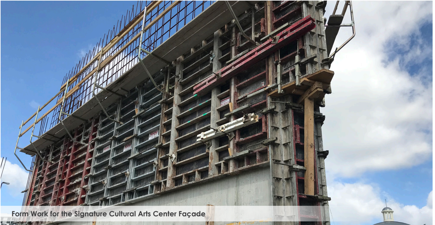
Form Work for the Signature Cultural Arts Center Façade