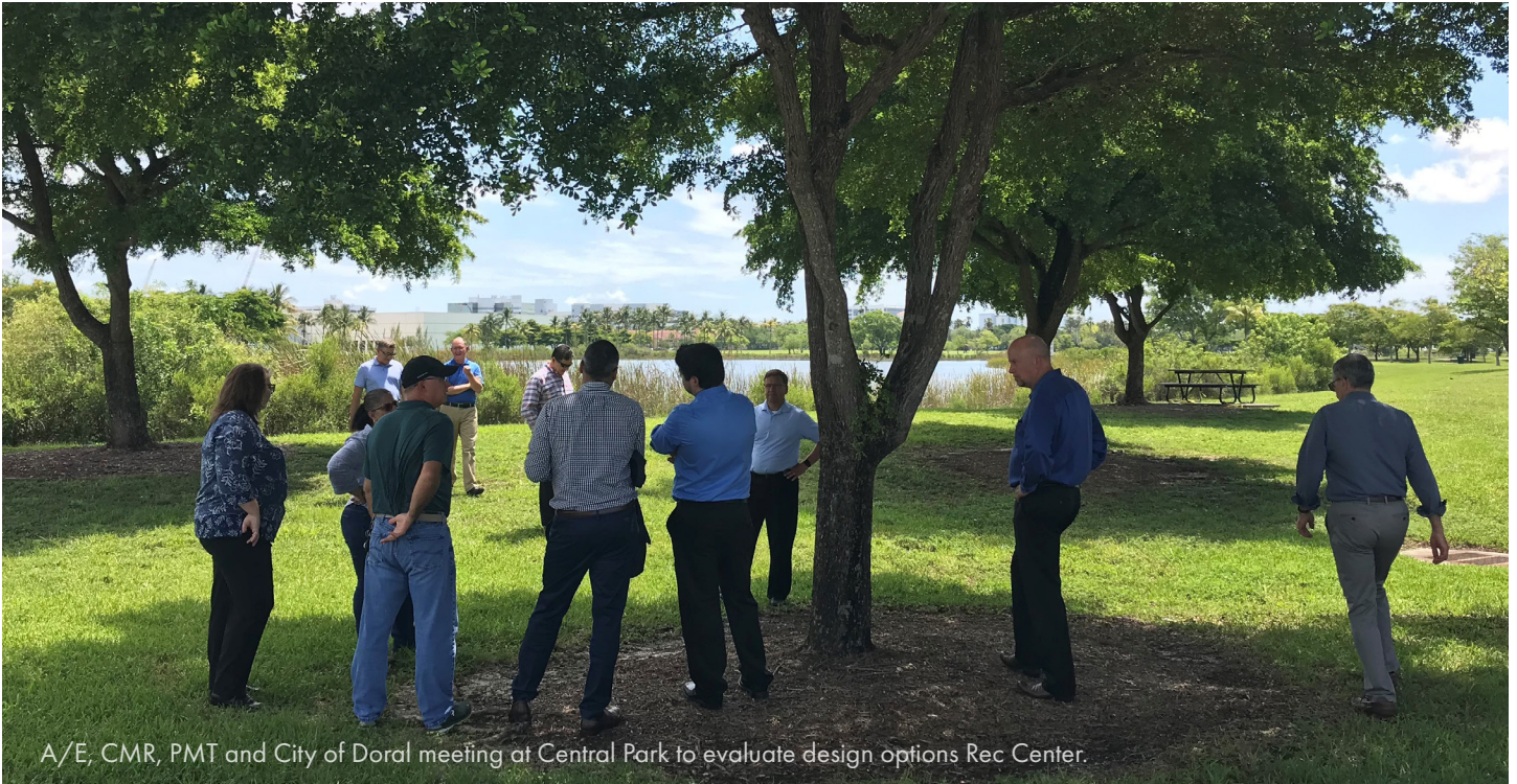
A/E, CMR, PMT and City of Doral meeting at Central Park to evaluate design options Rec Center.