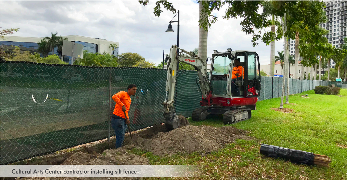
Cultural Arts Center contractor installing silt fence