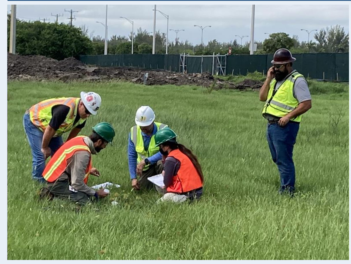
Inspection of Isolated Wet Lands