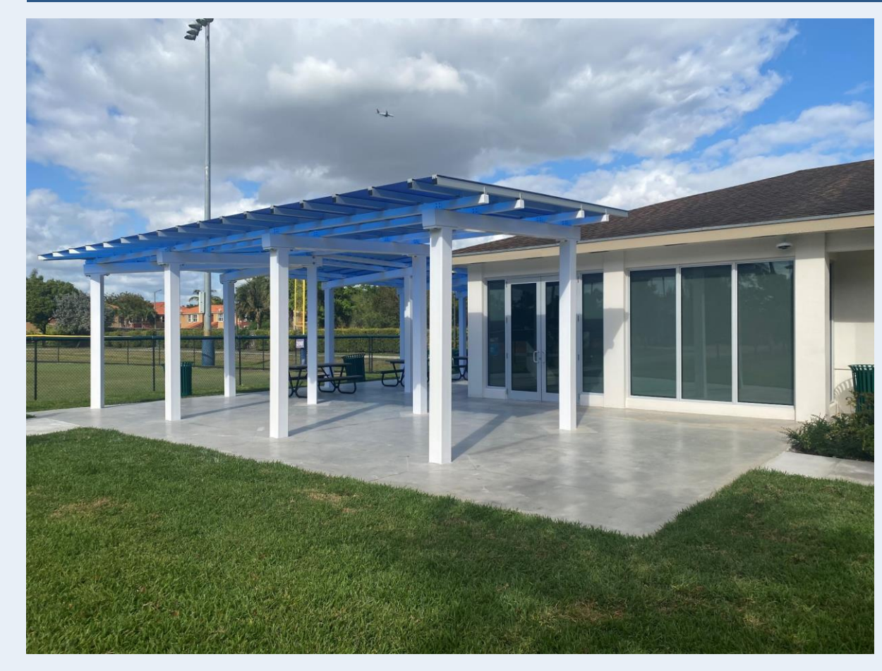
Doral Meadow outdoor flex space with new pergola