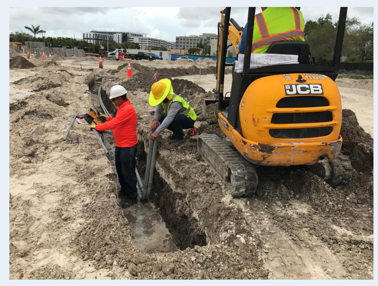
Open trench for the installation of electrical and fiber conduits