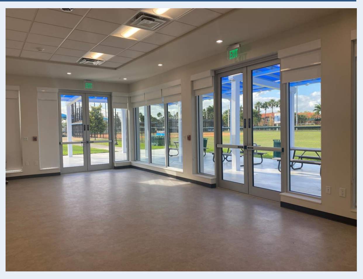
Doral Meadow multipurpose indoor space