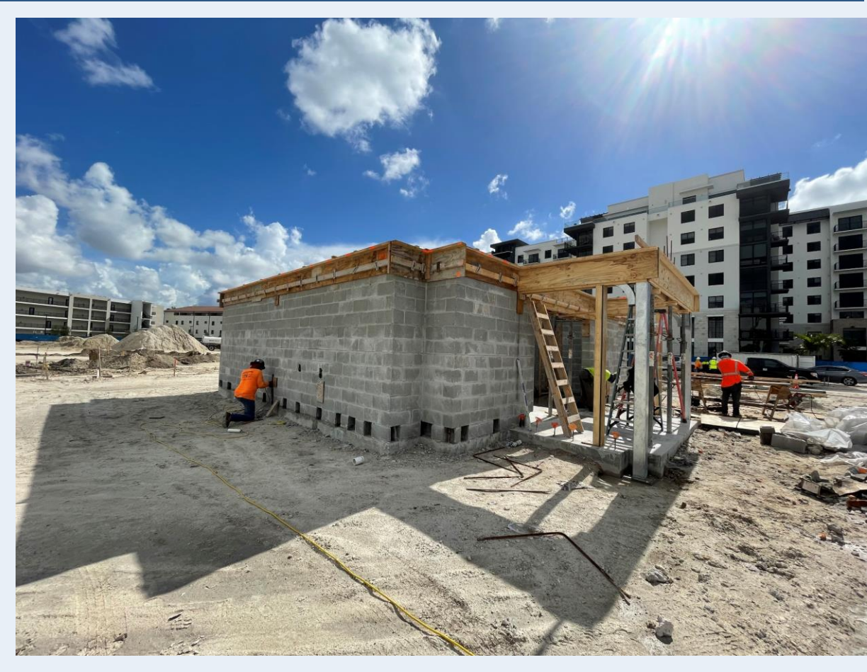
White Course restroom