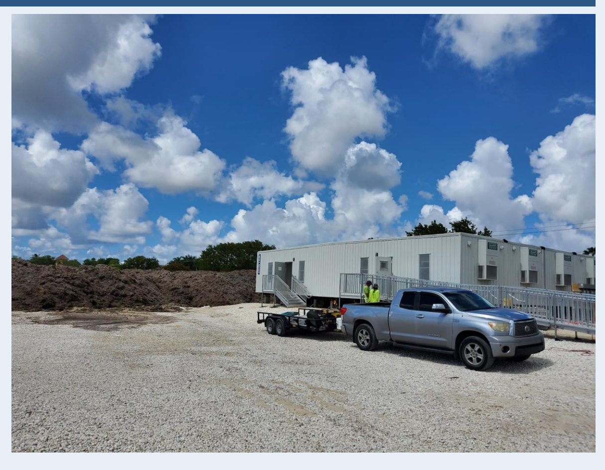
Trailer Installation at Site