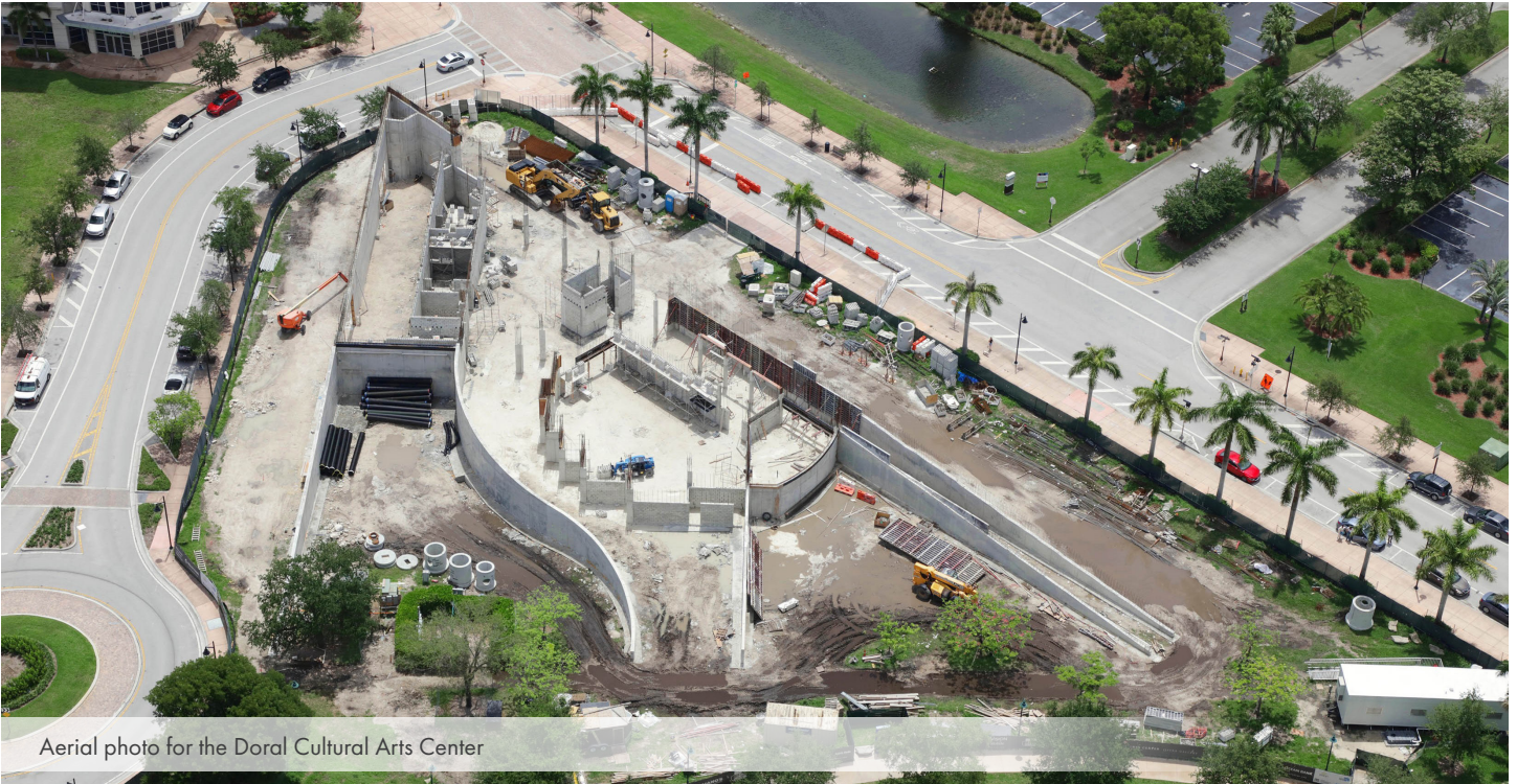
Aerial photo for the Doral Cultural Arts Center