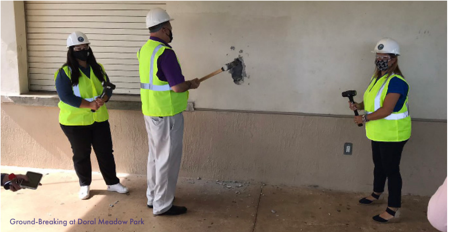
Ground-Breaking at Doral Meadow Park