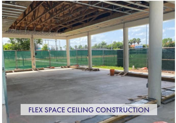
FLEX SPACE CEILING CONSTRUCTION