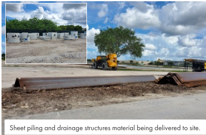
Sheet piling and drainage structures material being delivered to site.