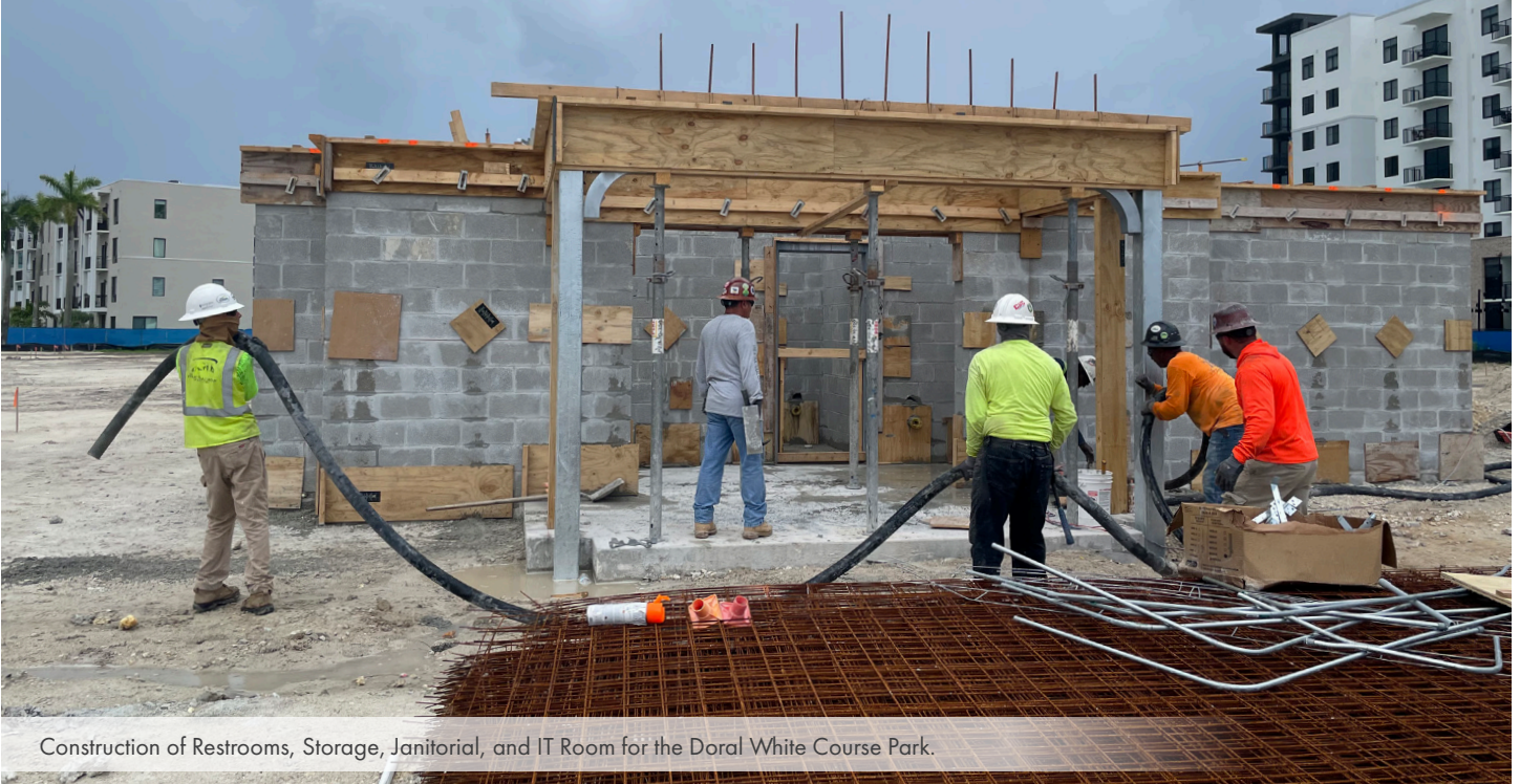
Construction of Restrooms, Storage, Janitorial, and IT Room for the Doral White Course Park.