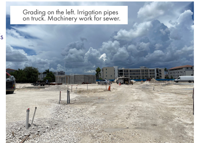
Grading on the left. Irrigation pipes on truck. Machinery work for sewer.