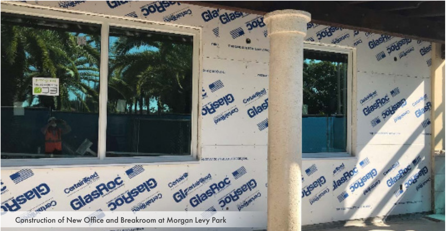
Construction of New Office and Breakroom at Morgan Levy Park