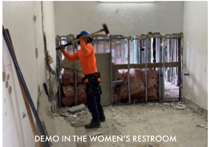
DEMO IN THE WOMEN'S RESTROOM