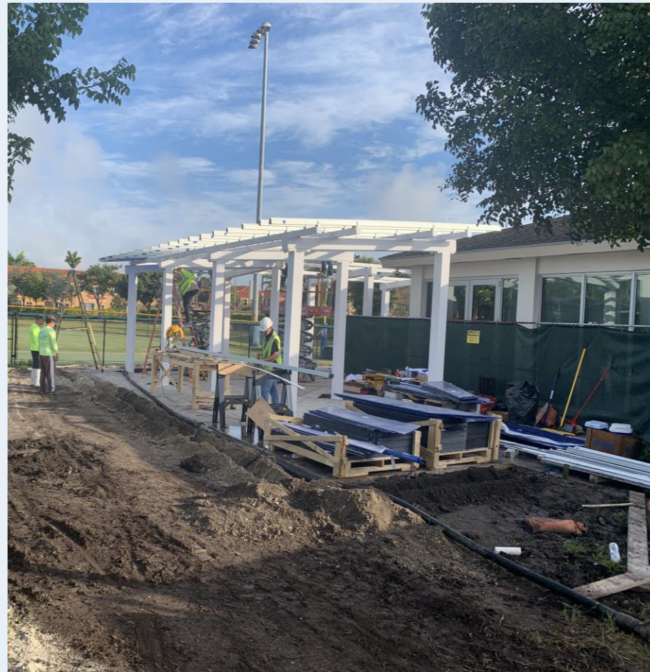
Work continues around the plaza setting the structure