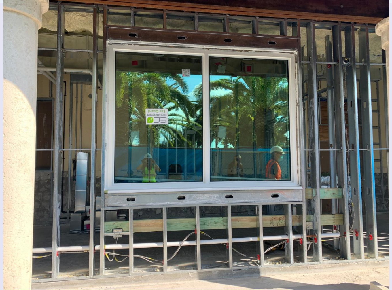
Installation of new window in future employee breakroom