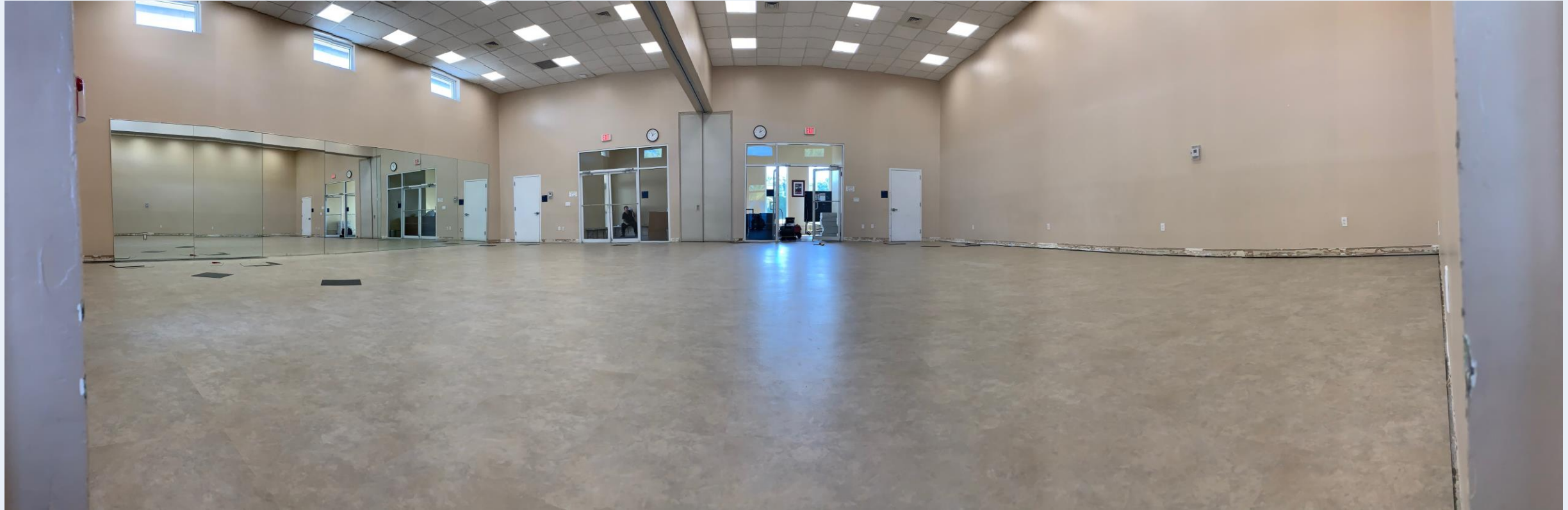
New LVT flooring installed in Multi-purpose Room