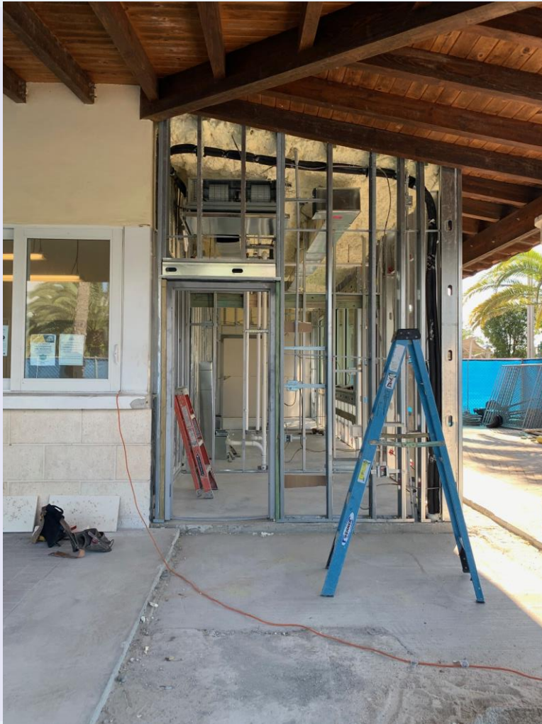
Metal stud framing/ HVAC for new addition