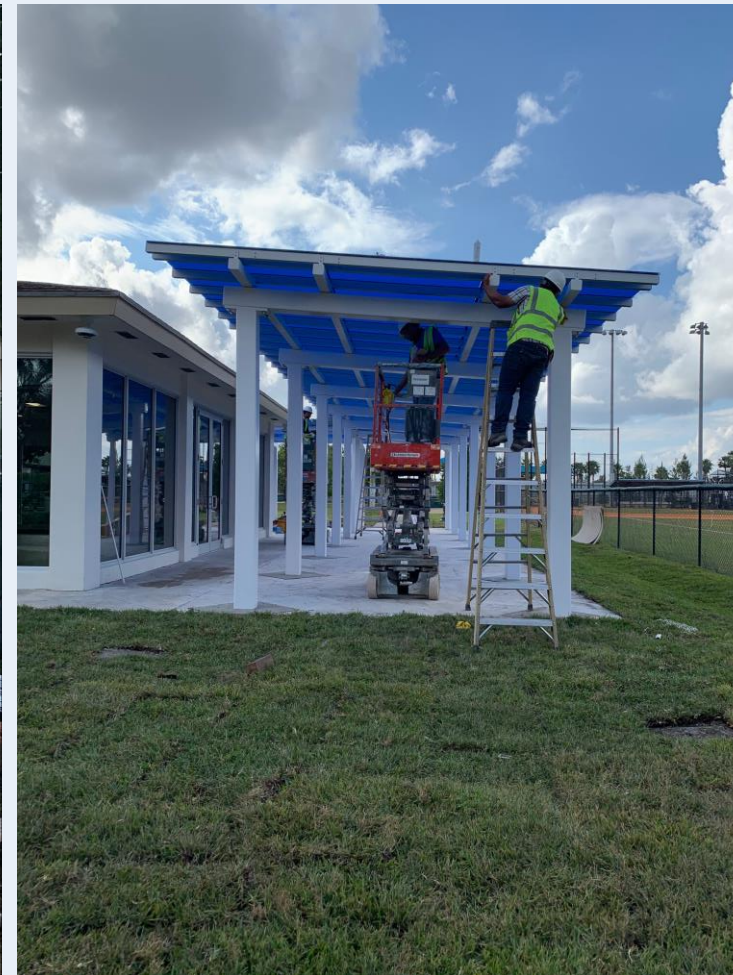
installation and alignment of polycarbonate sheets for roofing