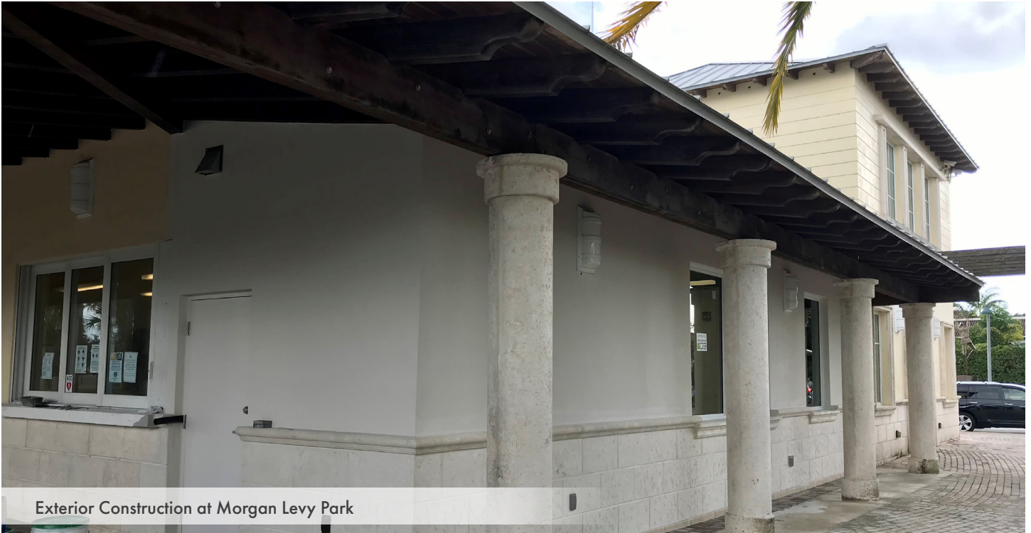
Exterior Construction at Morgan Levy Park