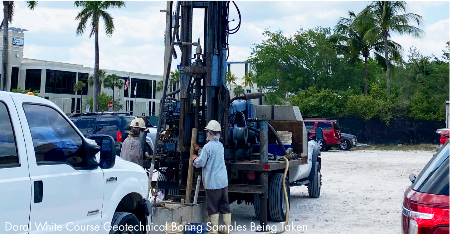
Doral White Course Geotechnical Boring Samples Being Taken