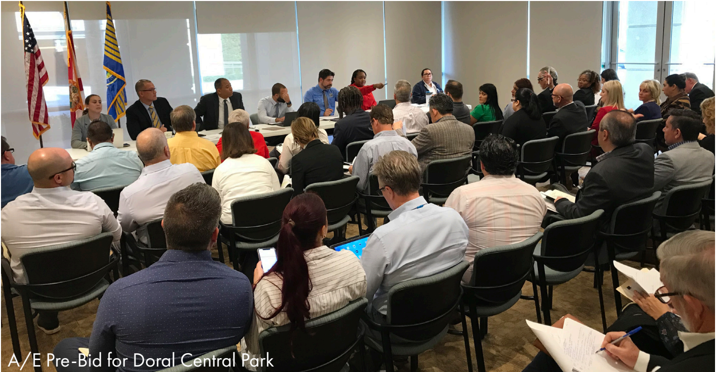
A/E Pre-Bid for Doral Central Park