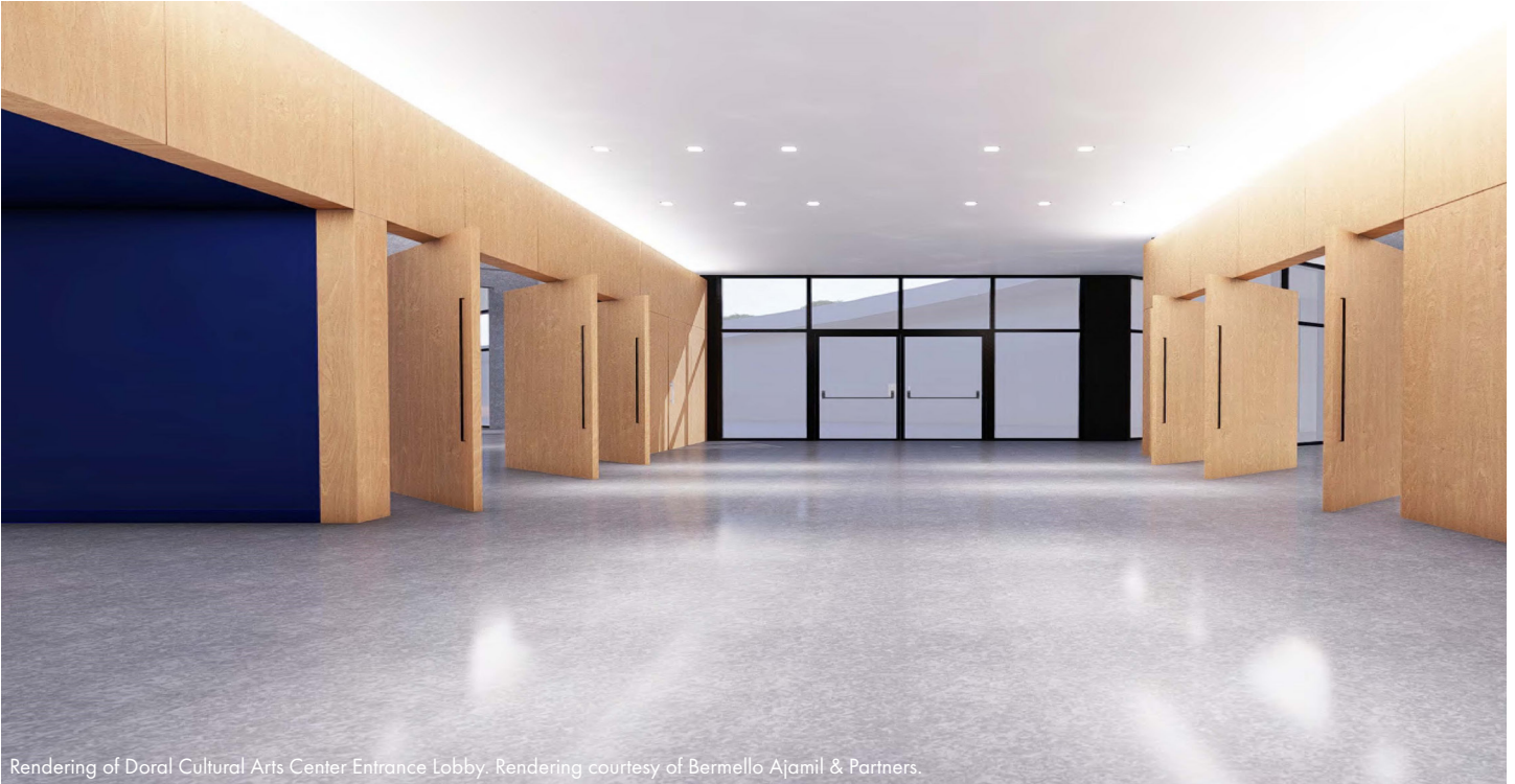
Rendering of Doral Cultural Arts Center Entrance Lobby. Rendering courtesy of Bermello Ajamil & Partners.